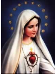
St. Mary, Mother of Christ Queen of the Knights